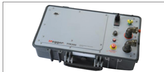
TTR300 — remote controlled "black box" unit