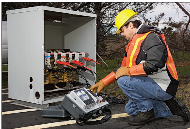
TTR330 shown testing a pad mount three-phase transformer