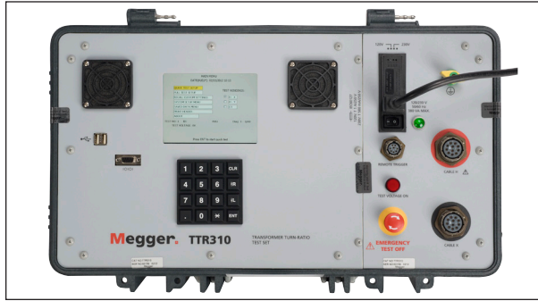
TTR310 — text-based unit with color display